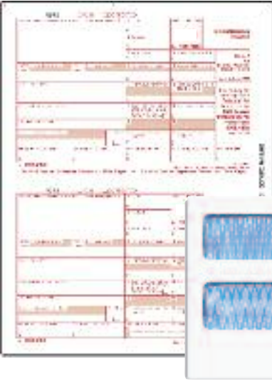
(Laser 1099DIV and 1099R are the 2-UP format)